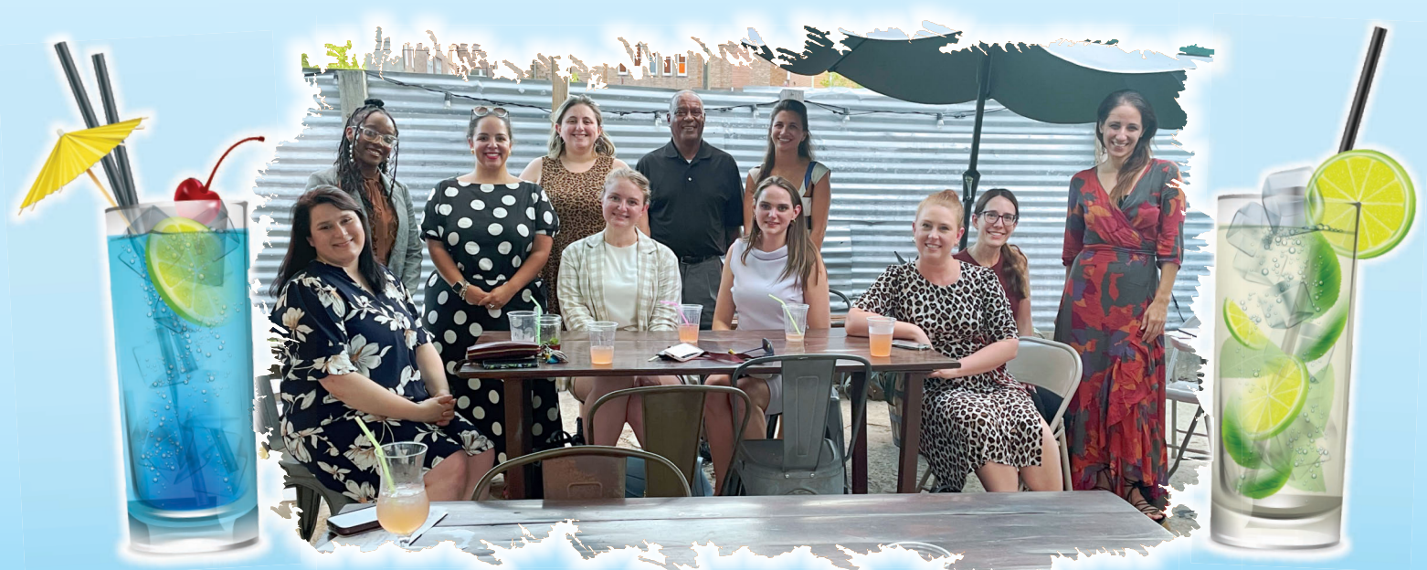
Cocktails and Career Conversations Attendees at Happy Raptor Distilling.

The event wrapped up with a philosophical discussion among everyone related to whether people are even socializing in person anymore or if they are just resorting to the internet and phones. Ultimately, the answer to this question turned on individual choice in building one's brand. Going forward, all participants definitely gained new inspiration on how to achieve their branding goals.